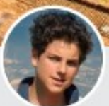
Bl Carlo Acutis