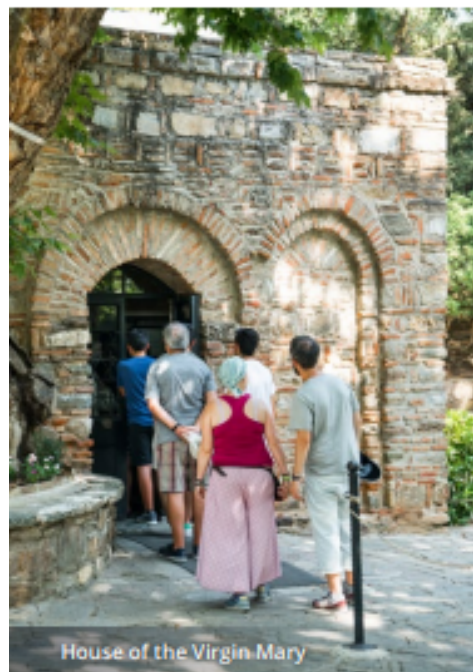
House of the Virgin Mary